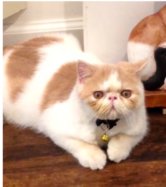
Dobi our Hospital Elf!